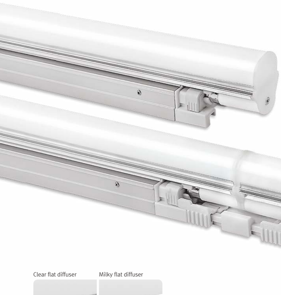
Clear flat diffuser