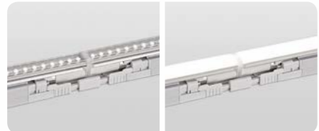
Milky flat diffuser